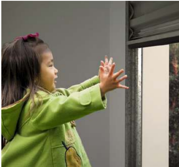
*This feature refers to Centurion Residential "A" Series Only

Featuring designs such as our "Safe-Edge" to protect your fingers and our high security and cyclone proof range, our roller doors are designed to protect you and what you care about most.